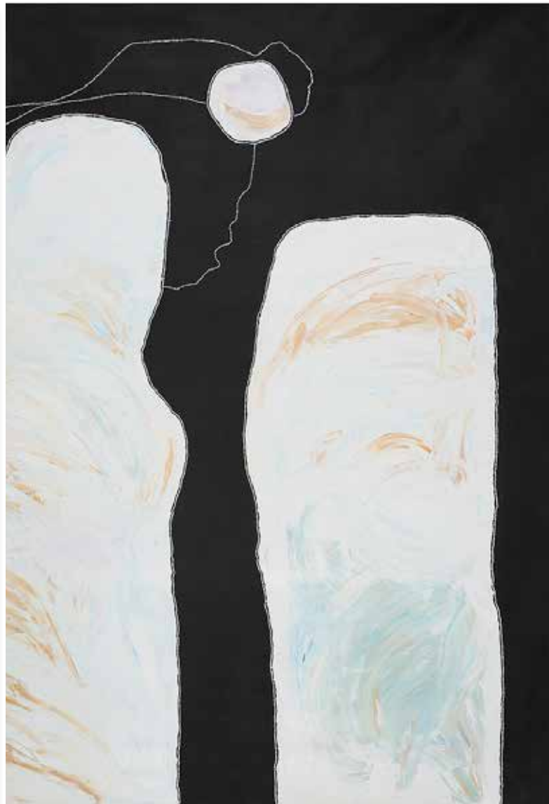
Lake Baker 2021 acrylic on linen 290 x 400 cm (2 Panels 290 x 200cm each) 21-354