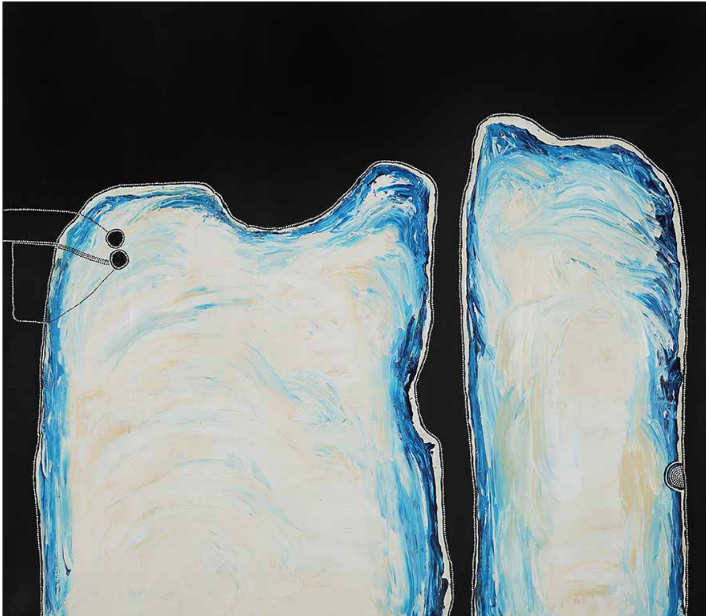
Lake Baker at night 2022 acrylic and phosphorescent pigment on linen 230 x 200 cm 22-133