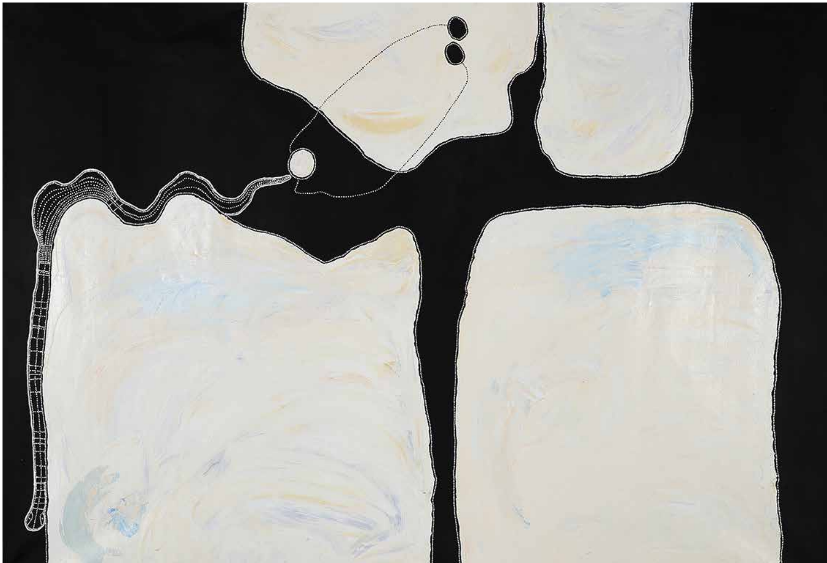
Lake Baker 2022 acrylic on linen 290 x 200 cm 22-126