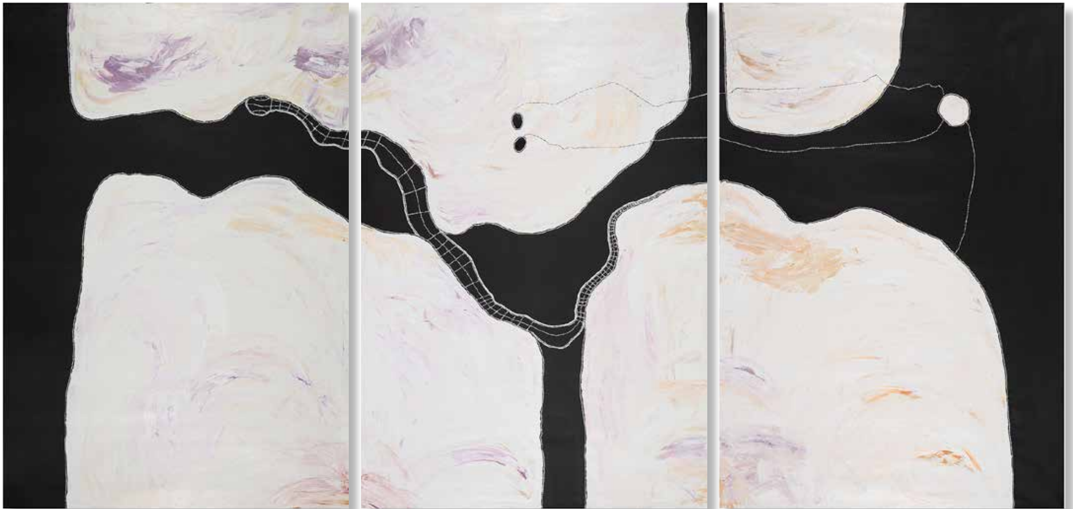
Lake Baker 2022 acrylic on linen 290 x 600 cm (3 panels 290 x 200cm each) 22-006