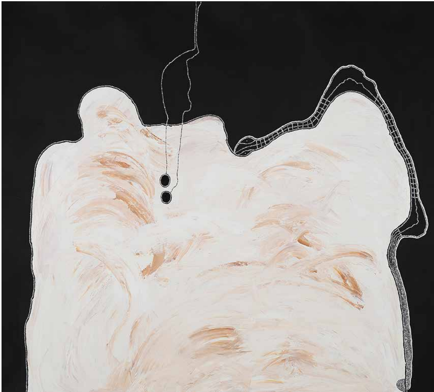
Lake Baker 2021 acrylic on linen 230 x 200 cm 21-450