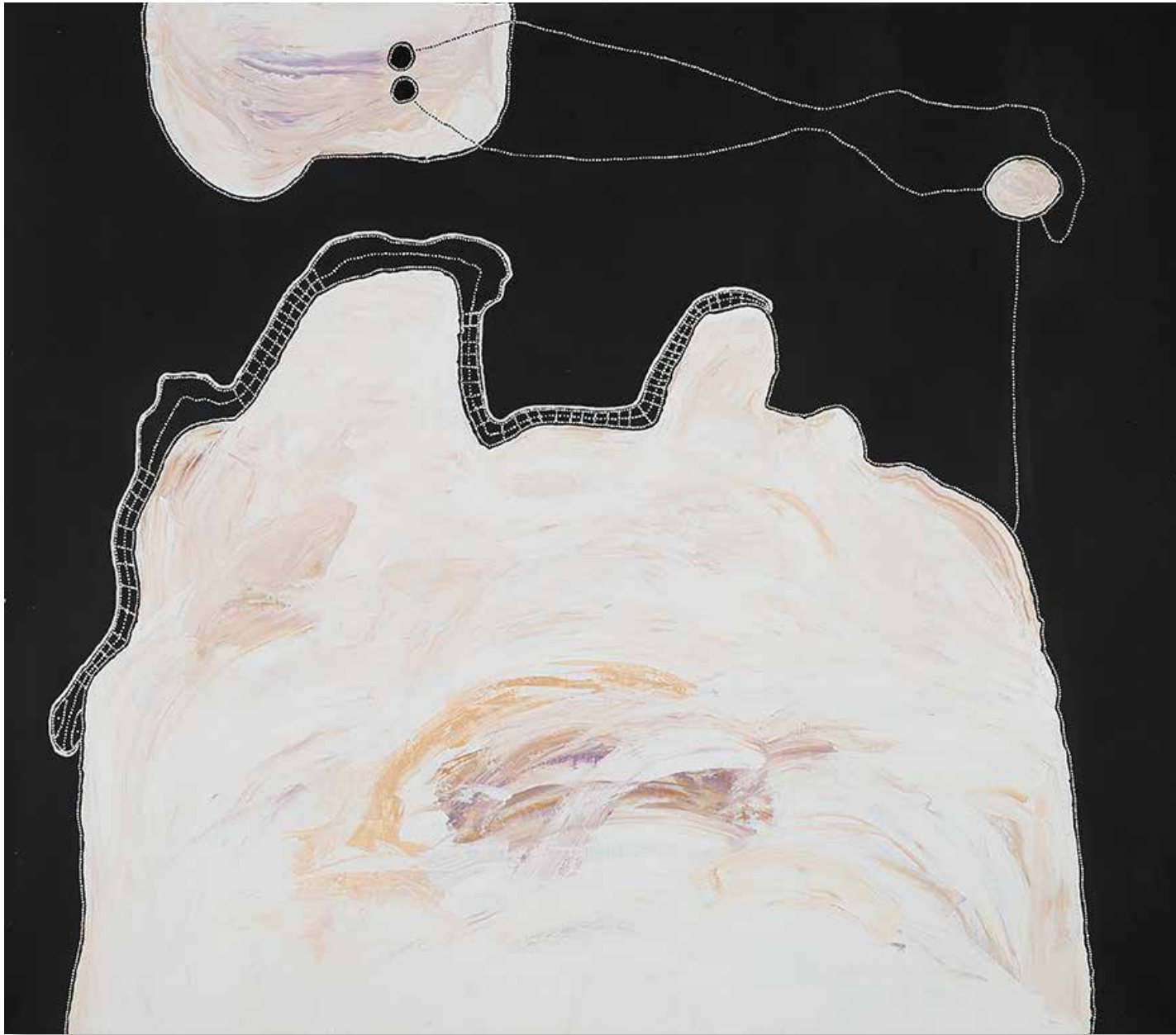
Lake Baker 2021 acrylic on linen 230 x 200 cm 21-355