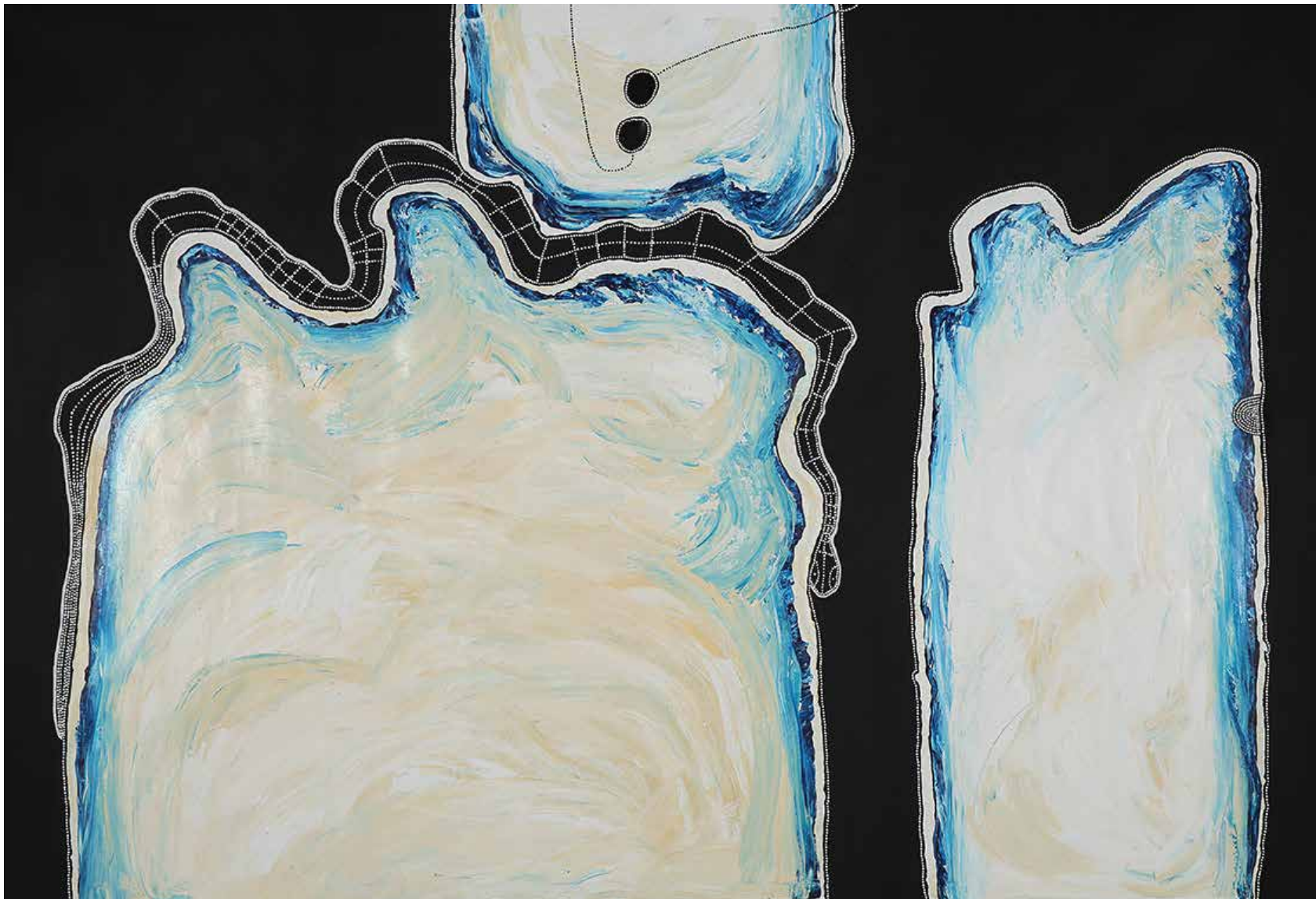
Lake Baker at night 2022 acrylic and phosphorescent pigment on linen 230 x 200 cm 22-146