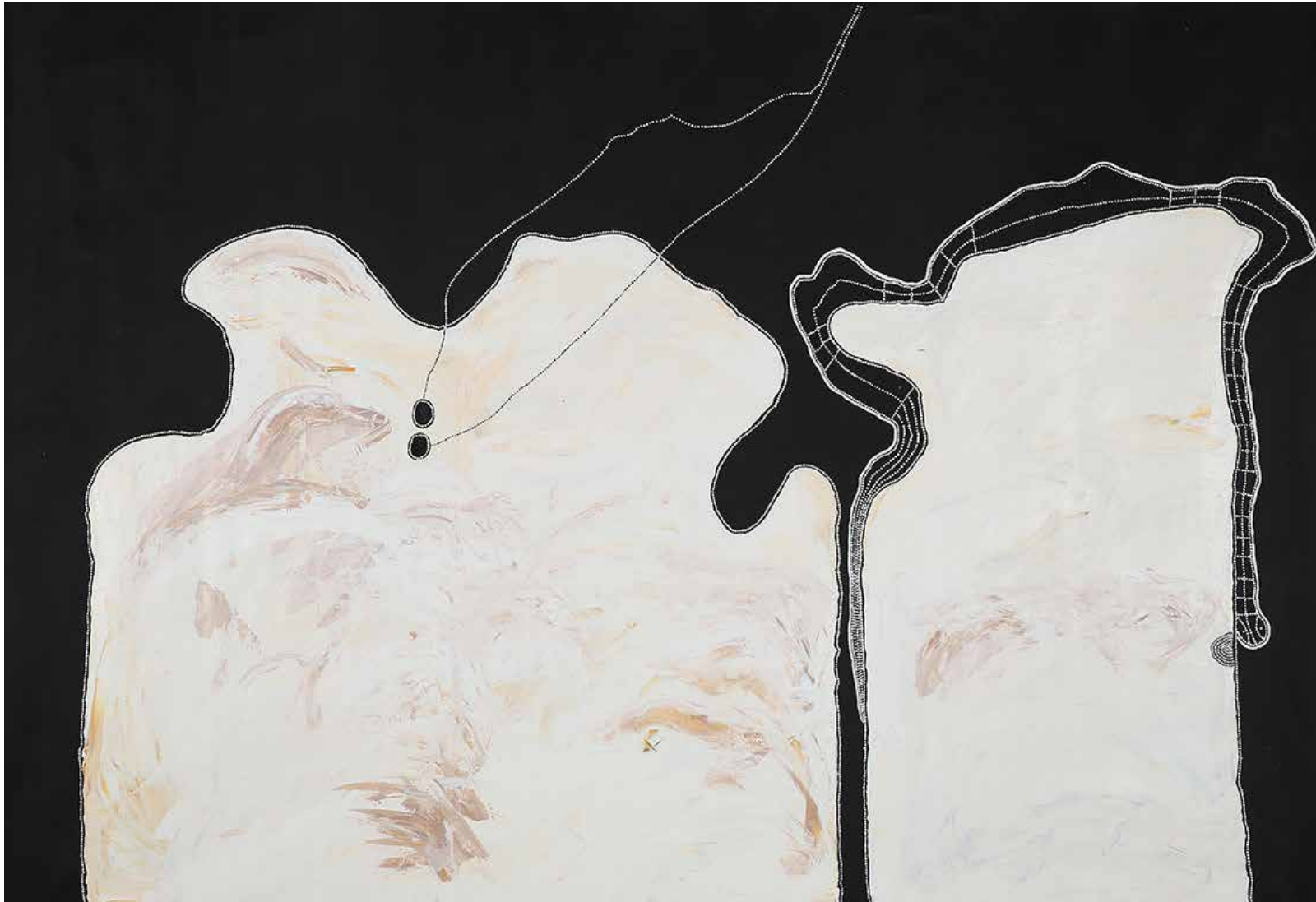
Lake Baker 2021 acrylic on linen 290 x 200 cm 21-35!