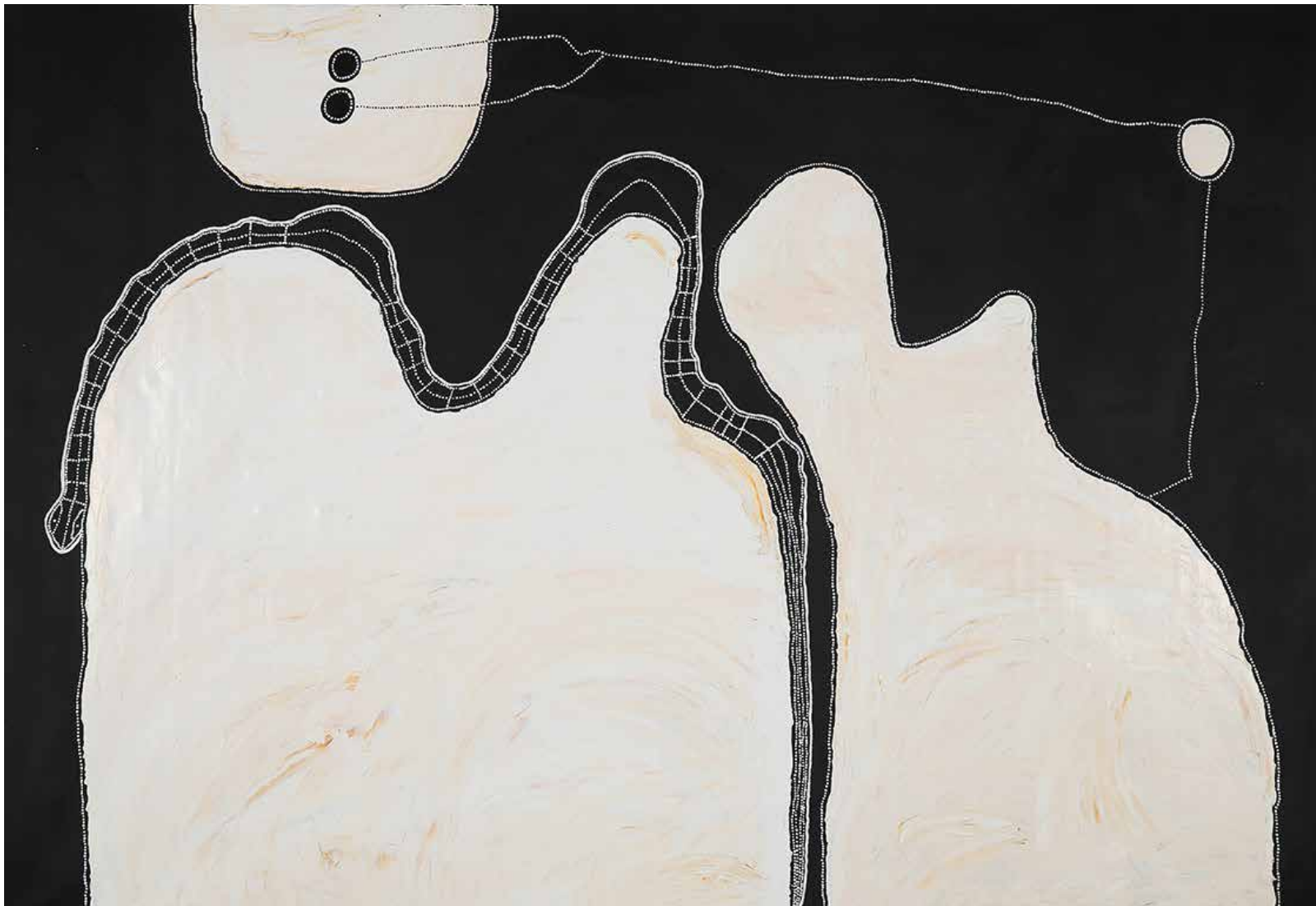
Lake Baker 2021 acrylic on linen 290 x 200 cm 21-210