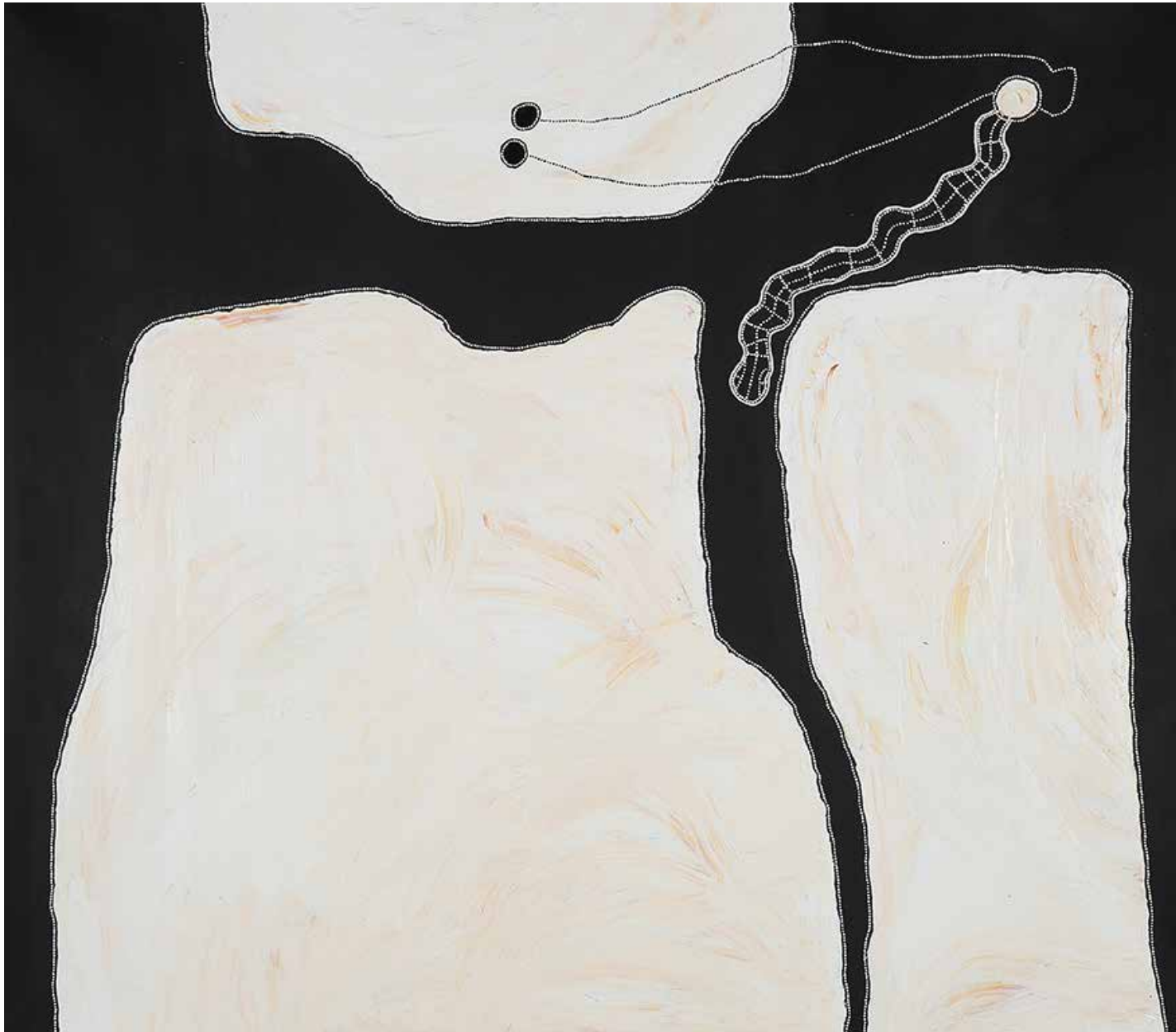
Lake Baker 2022 acrylic on linen 230 x 200 cm 22-123