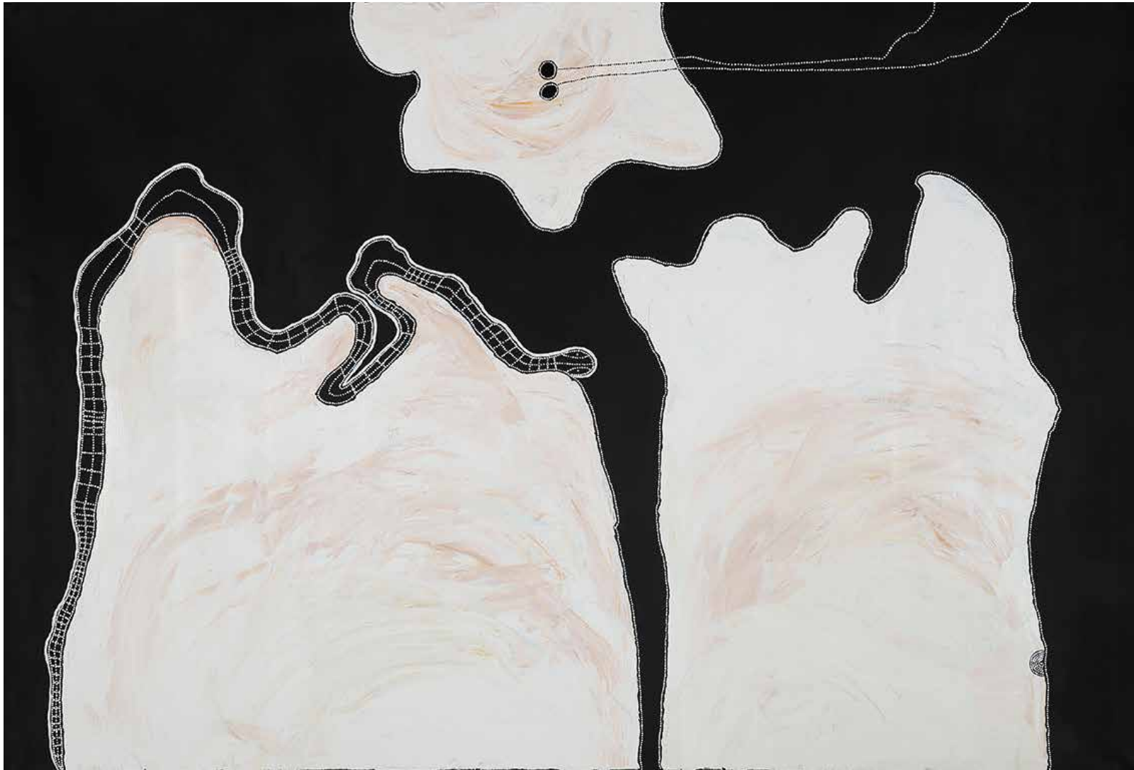
Lake Baker 2021 acrylic on linen 290 x 200 cm 21-350