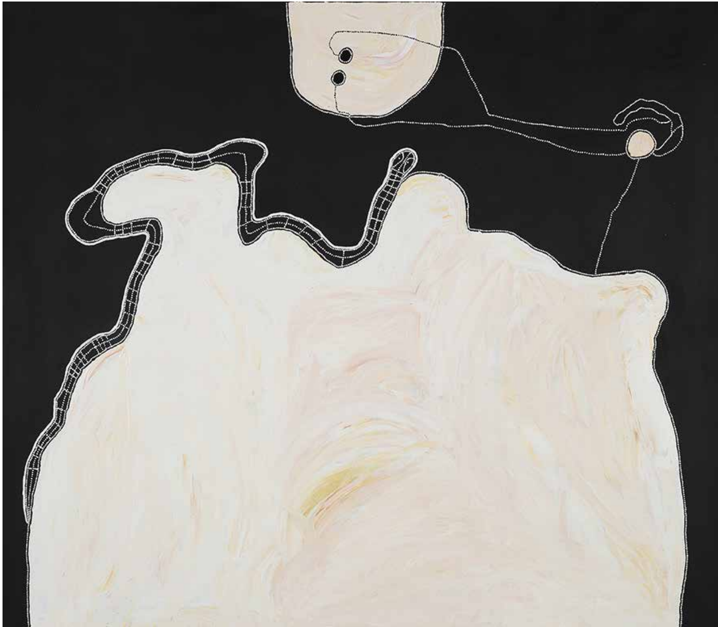
Lake Baker 2021 acrylic on linen 230 x 200 cm 21-367