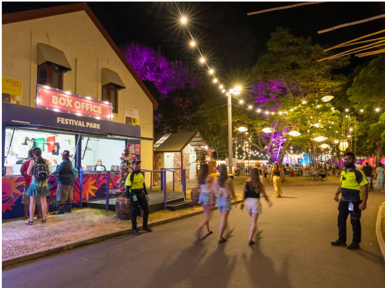
Image Description: Nighttime festival scene with people, lights, and a box office booth.

As you enter Festival Park, on your left, you will see the Box Office. There you can buy tickets to Darwin Festival shows, and pick up a free Festival Program.