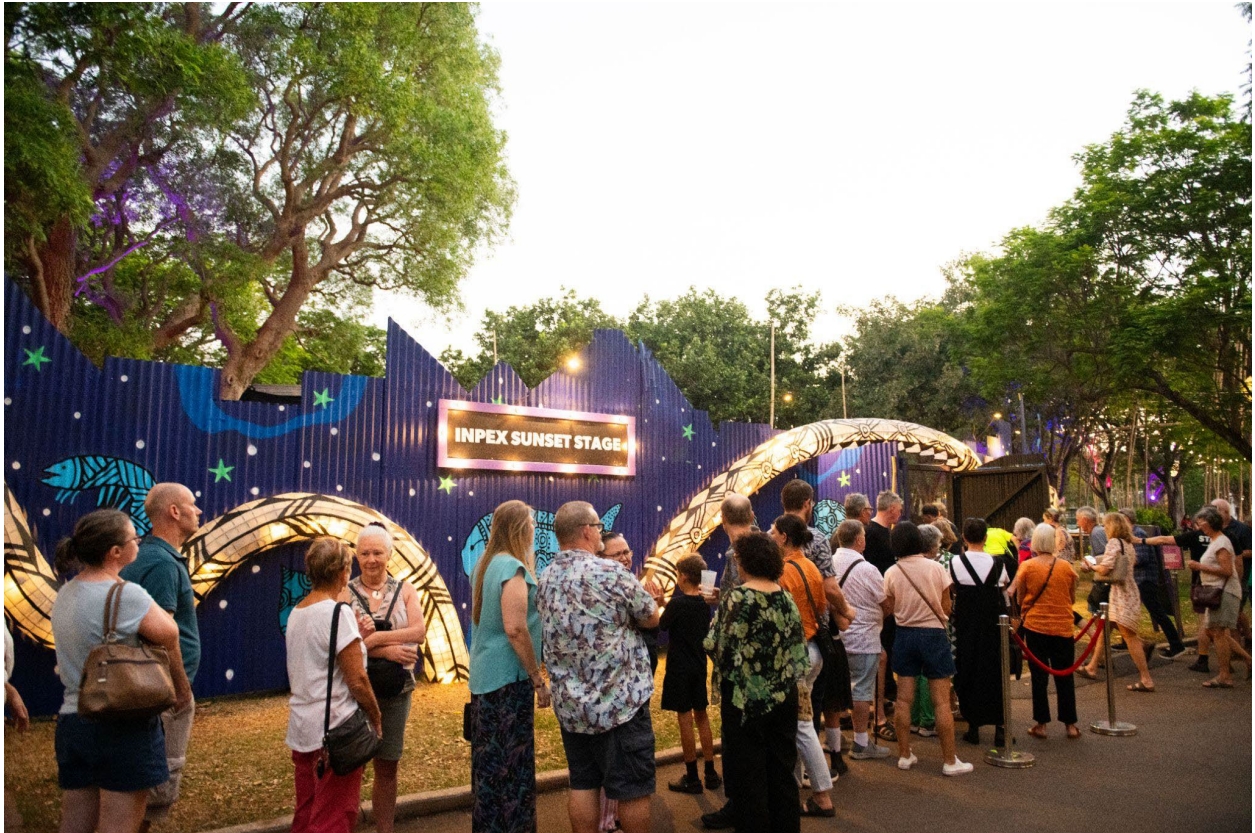
Image Description: People lining up outside the illuminated entrance to the INPEX Sunset Stage, surrounded by trees and decorative elements.

To enter the INPEX Sunset Stage, you must have a ticket.