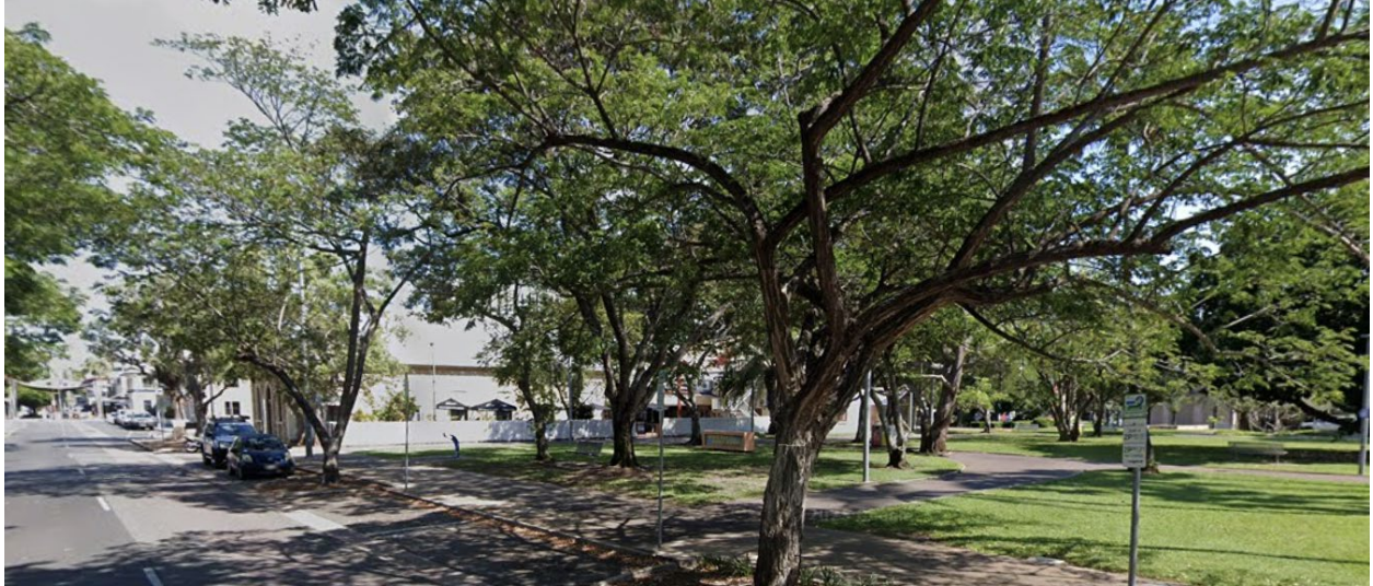
Image Description: Tree-lined street with parked cars, grassy areas, and buildings in the background under a clear sky.

Festival Park is located at Civic Park, near the corner of Smith St and Harry Chan Ave in the Darwin CBD.