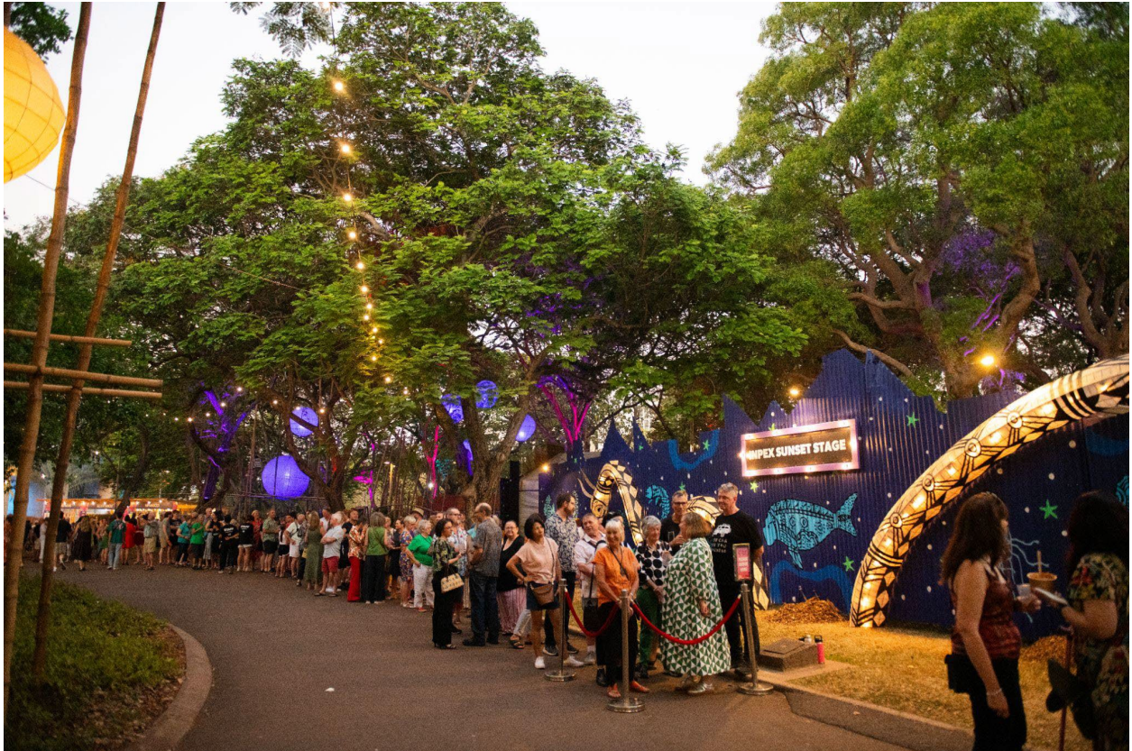
Image Description: Crowd lining up outside the INPEX Sunset Stage under festive lights.

To the right, you'll see the outside of the INPEX Sunset Stage.