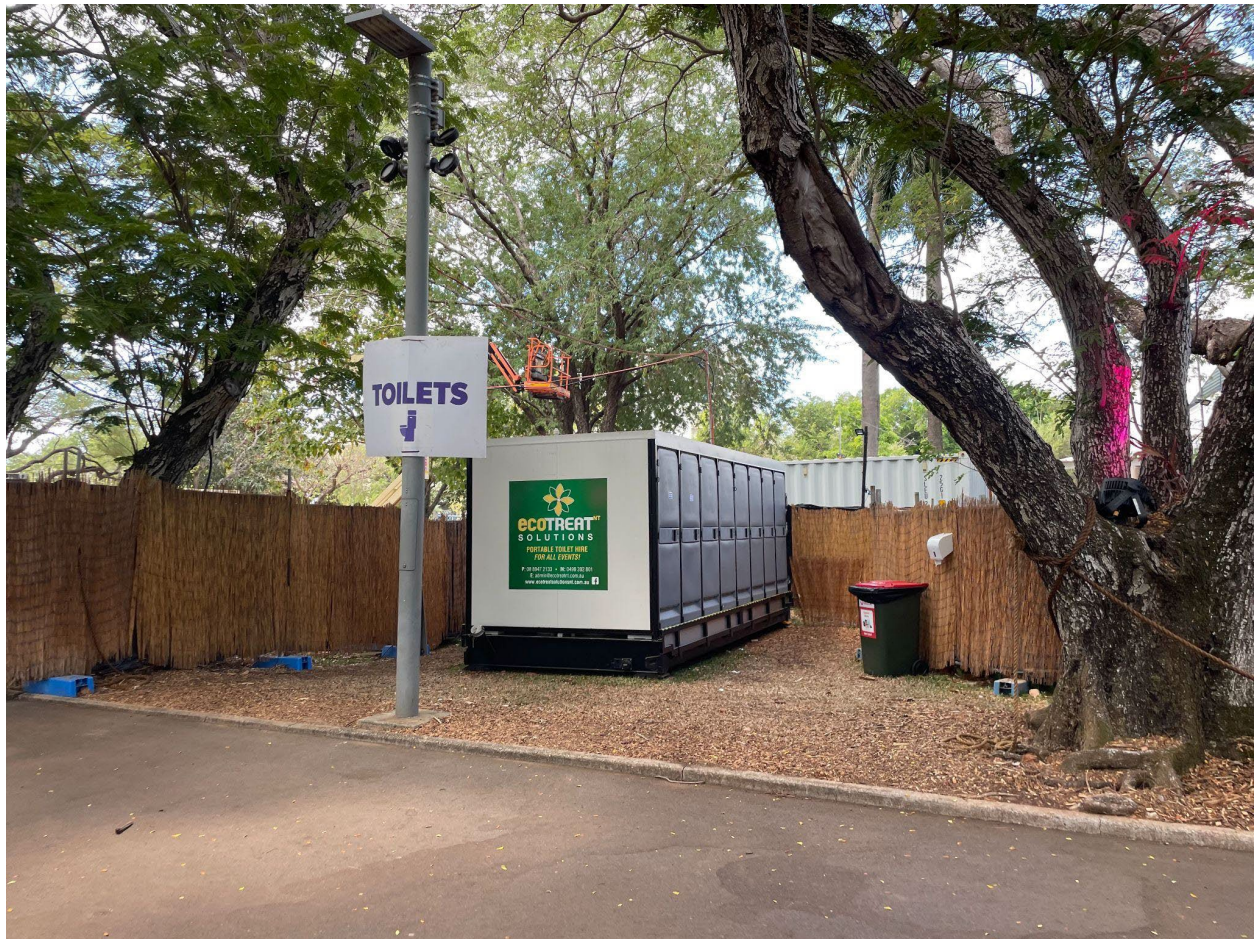
Image Description: Portable toilet unit from EcoTreat Solutions in a tree-lined outdoor area, marked by a "TOILETS" sign and accompanied by a green bin.

There are portaloos within the INPEX Sunset Stage, next to the bar.