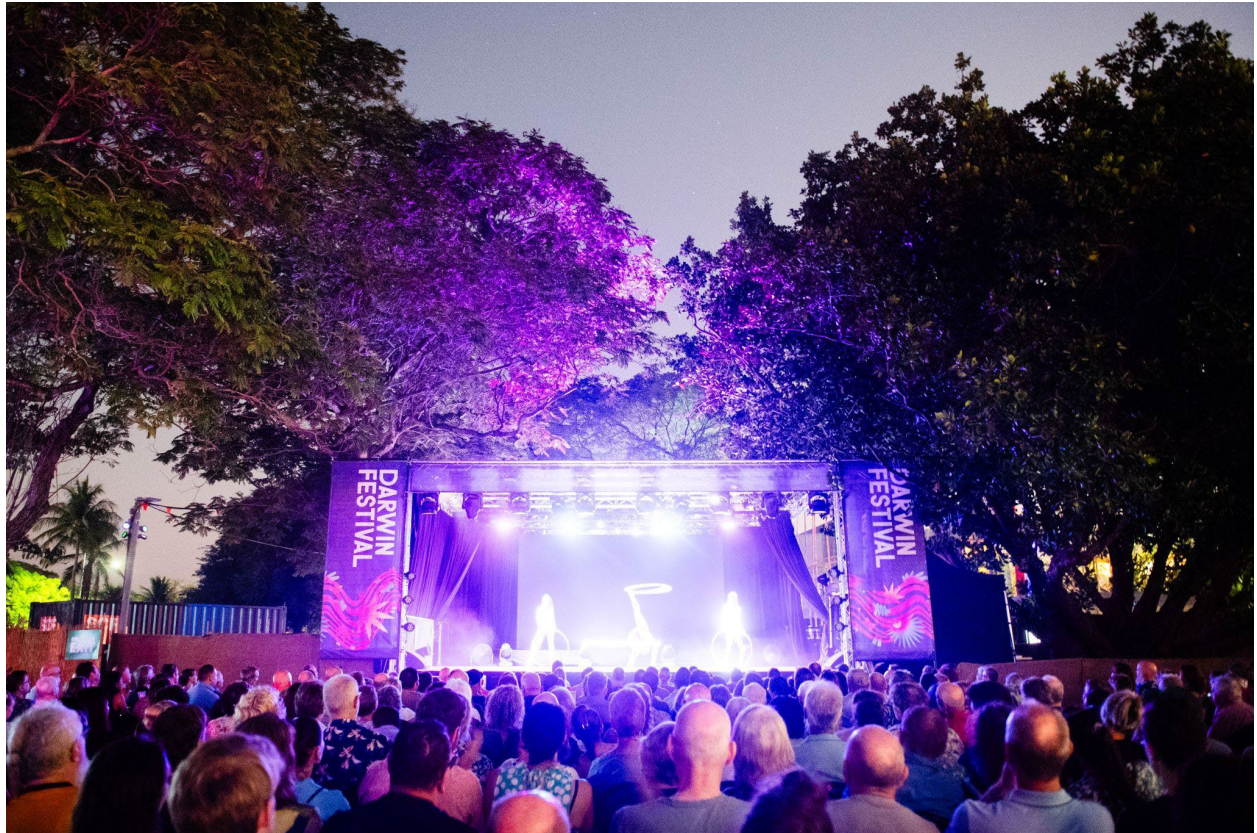
Image Description: Audience gathered at the INPEX Sunset Stage for a live performance at the Darwin Festival, with a brightly lit stage and surrounding trees.

INPEX Sunset Stage is at Festival Park. Many performances take place at this venue, from comedy to music to circus.