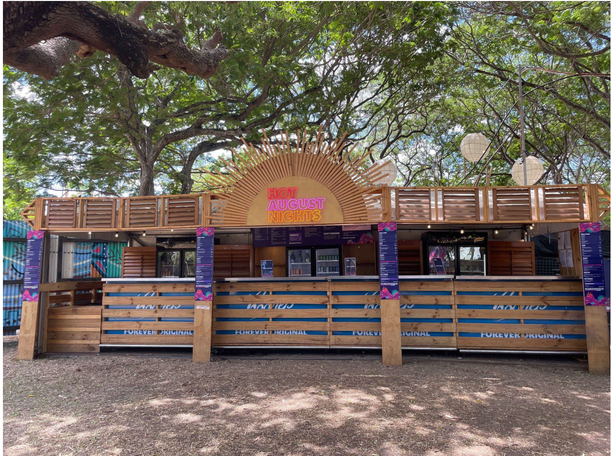
Image Description: Wooden bar beneath a large tree, featuring a bright “Hot August Nights” sign, decorative banners, and hanging lanterns.

To your left when you enter, you will see a bar where alcoholic and non-alcoholic drinks can be purchased by cash or card (card preferred). BYO alcohol is strictly prohibited.