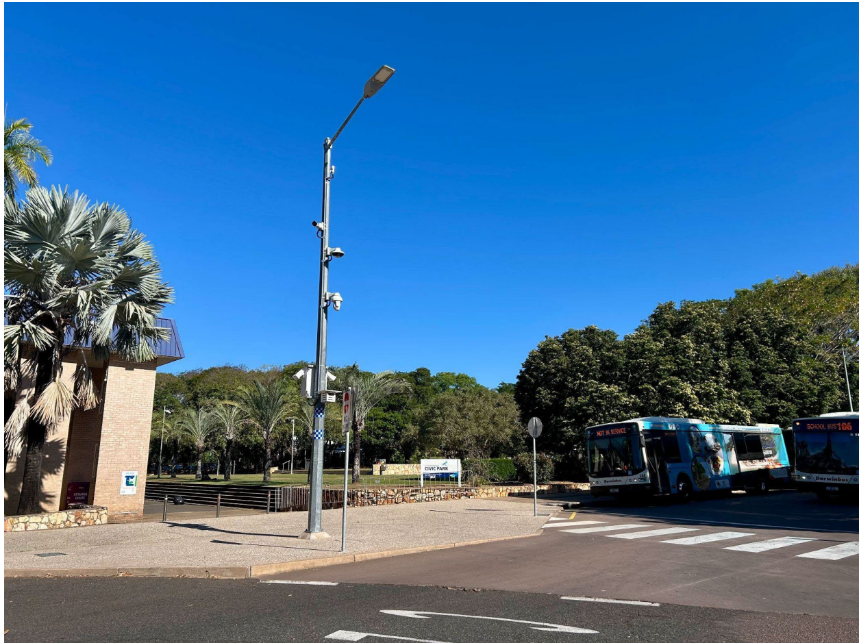
Image Description: A sunny street scene featuring a tall streetlight pole, palm trees near a building on the left, and two parked buses near a pedestrian crossing on the right.

There is a second entrance at the other side of the park, located where Cavenagh St meets Harry Chan Avenue. This entrance is in front of the City of Darwin building, and next to the bus interchange.