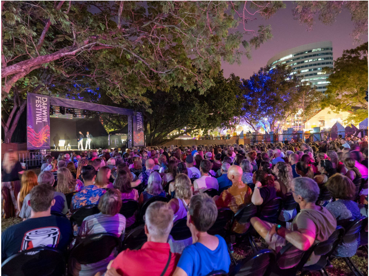
Image Description: Nighttime audience seated under trees, watching live performances at the INPEX Sunset Stage with colorful lighting.

When the performance takes place, there will be loud noise.