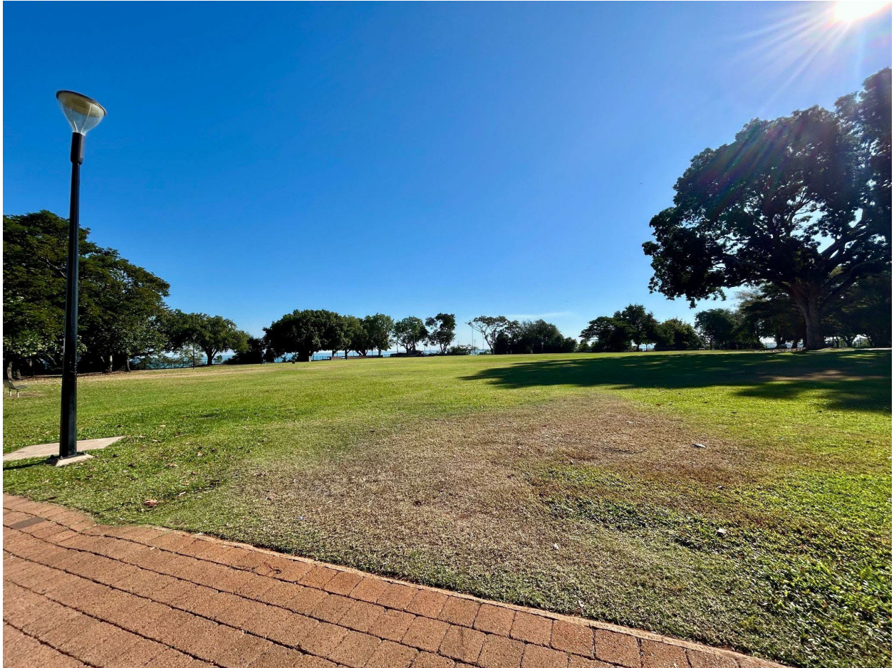
Image Description: A sunny open park with scattered trees, a brick pathway, and a single street lamp under a clear blue sky.

This is how the location looks when the Teddy Bears' Picnic is not there.