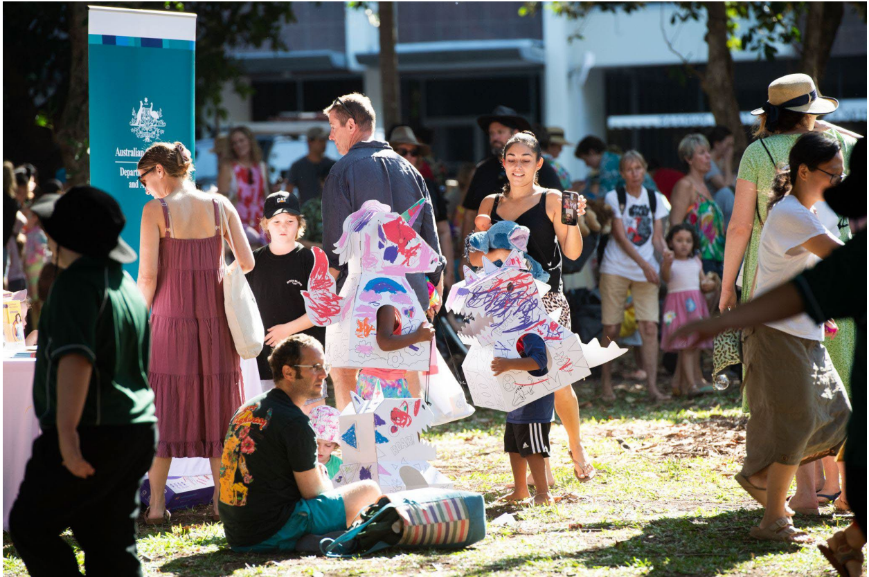
Image Description: A group of people, including children in costumes, gather in a shaded park

There will be lots of activities taking place at the same time, and lots of children and adults attending.