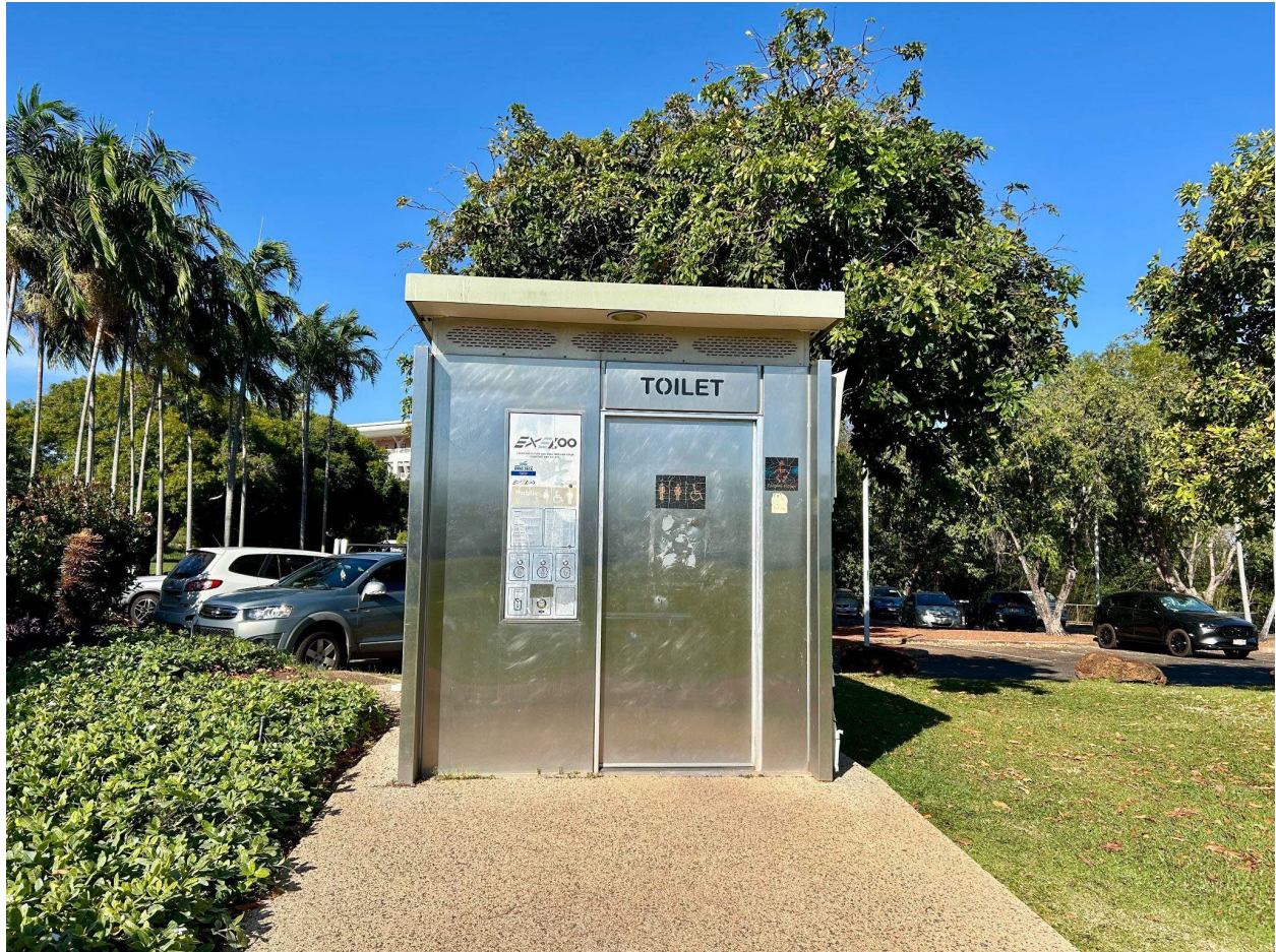
Image Description: A metal public toilet structure with signage, set outdoors near trees and parked cars.

There is a public, accessible toilet located near the Darwin Oval Car Park.