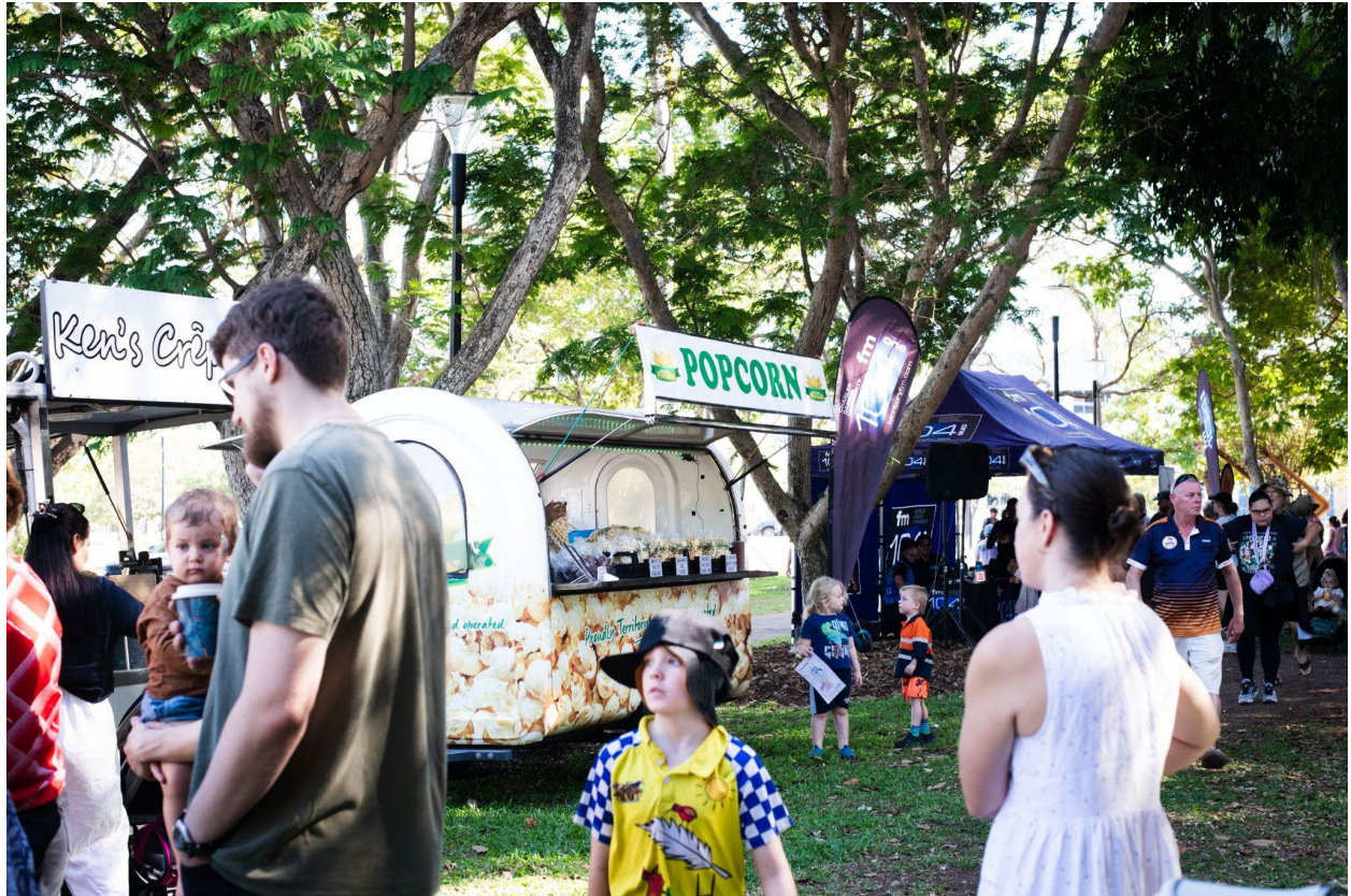
Image Description: People gather around shaded food stalls labeled "Ken's Crepes" and "Popcorn" in a park-like setting.

Food and drinks are available to purchase. Please check with the food stall to see if they accept cash or card.