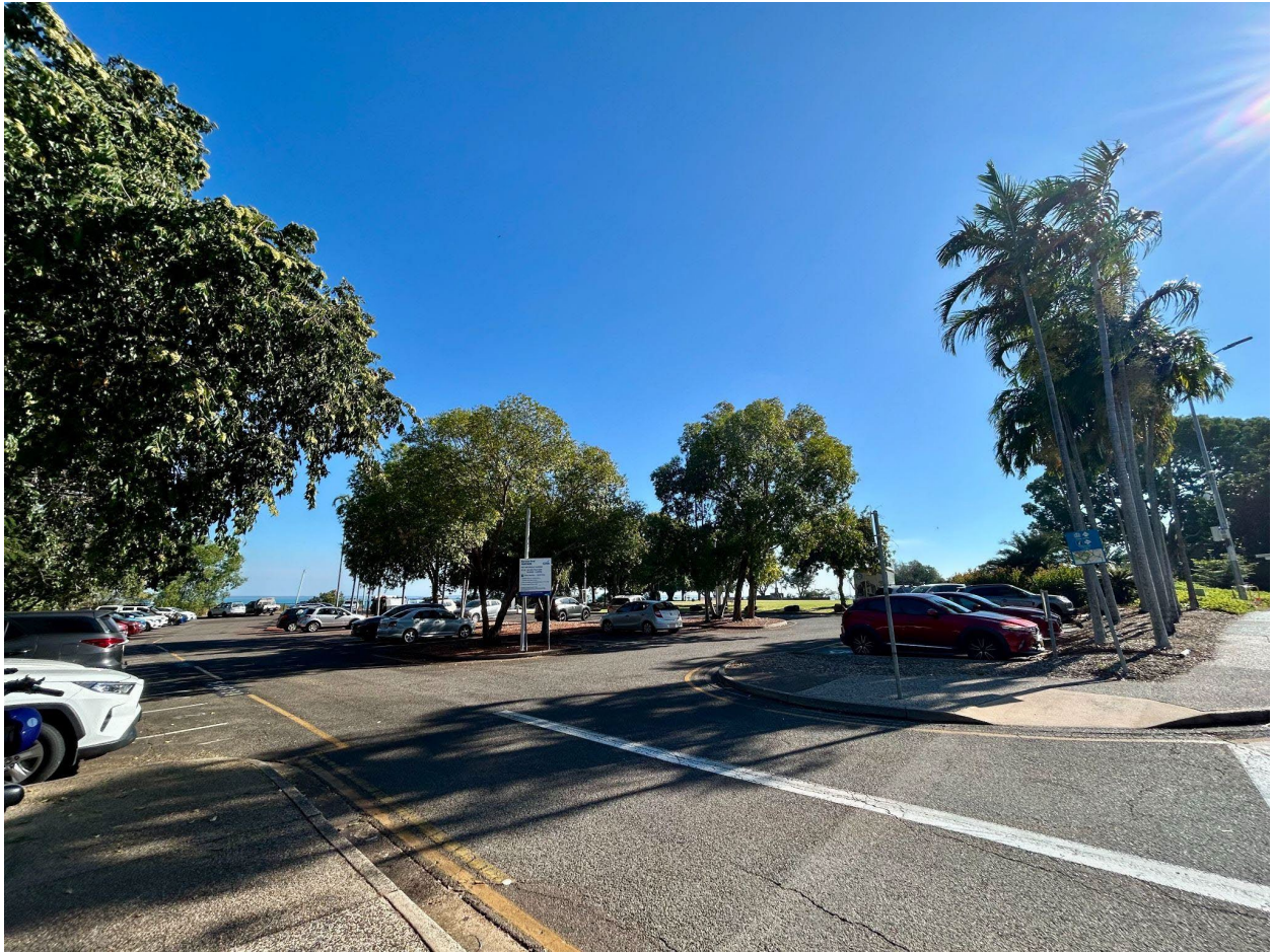
Image Description: A sunny parking lot with several cars parked under trees, including palm trees, with clear blue sky overhead.

There is limited parking available at Darwin Oval Car Park, which turns off The Esplanade.