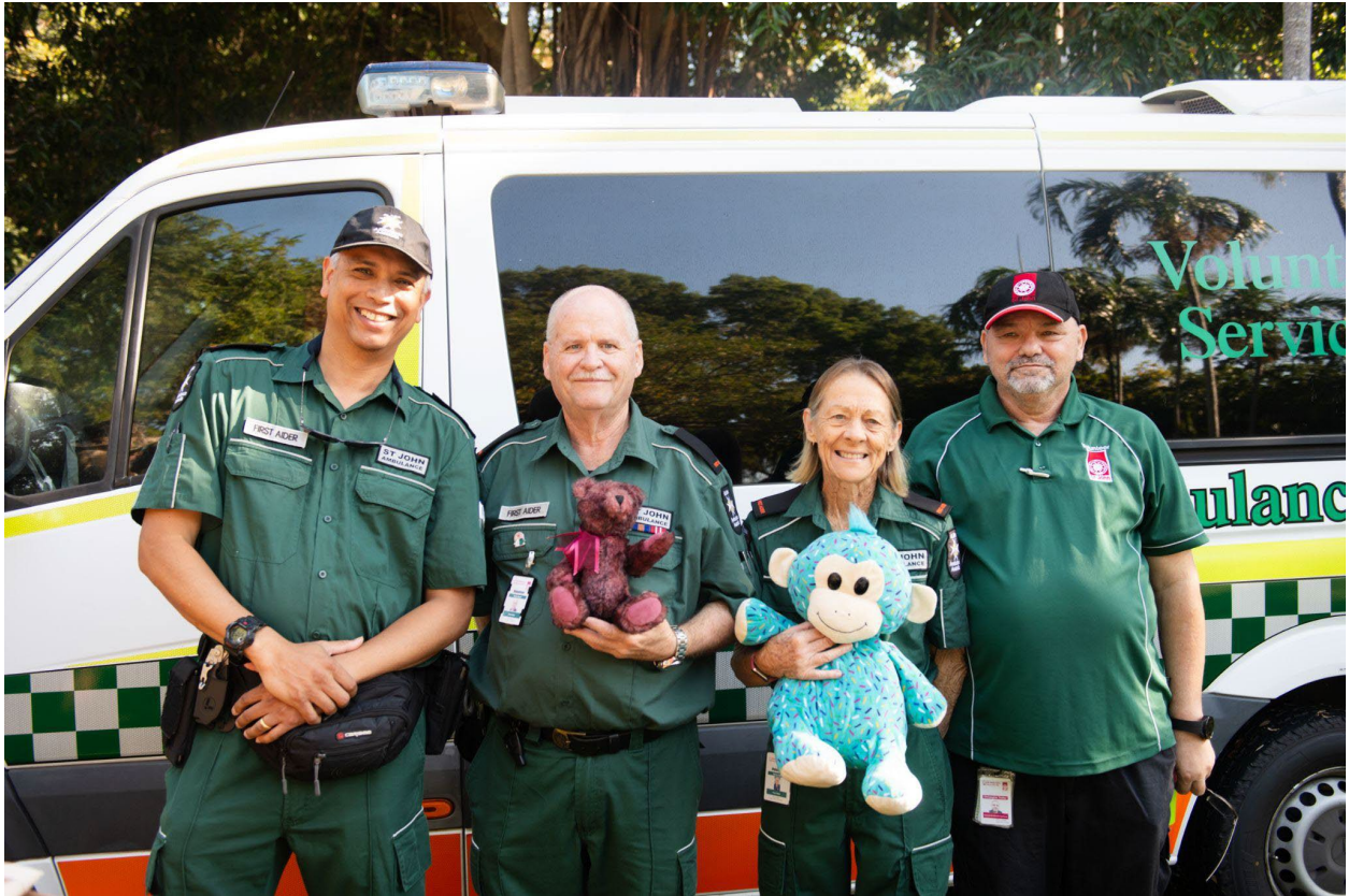
Image Description: Four people in green uniforms stand in front of an ambulance, with two holding stuffed animals—a purple teddy bear and a blue monkey.

St John's Ambulance Service will be there to provide First Aid. If you feel unwell, they will be happy to help you.