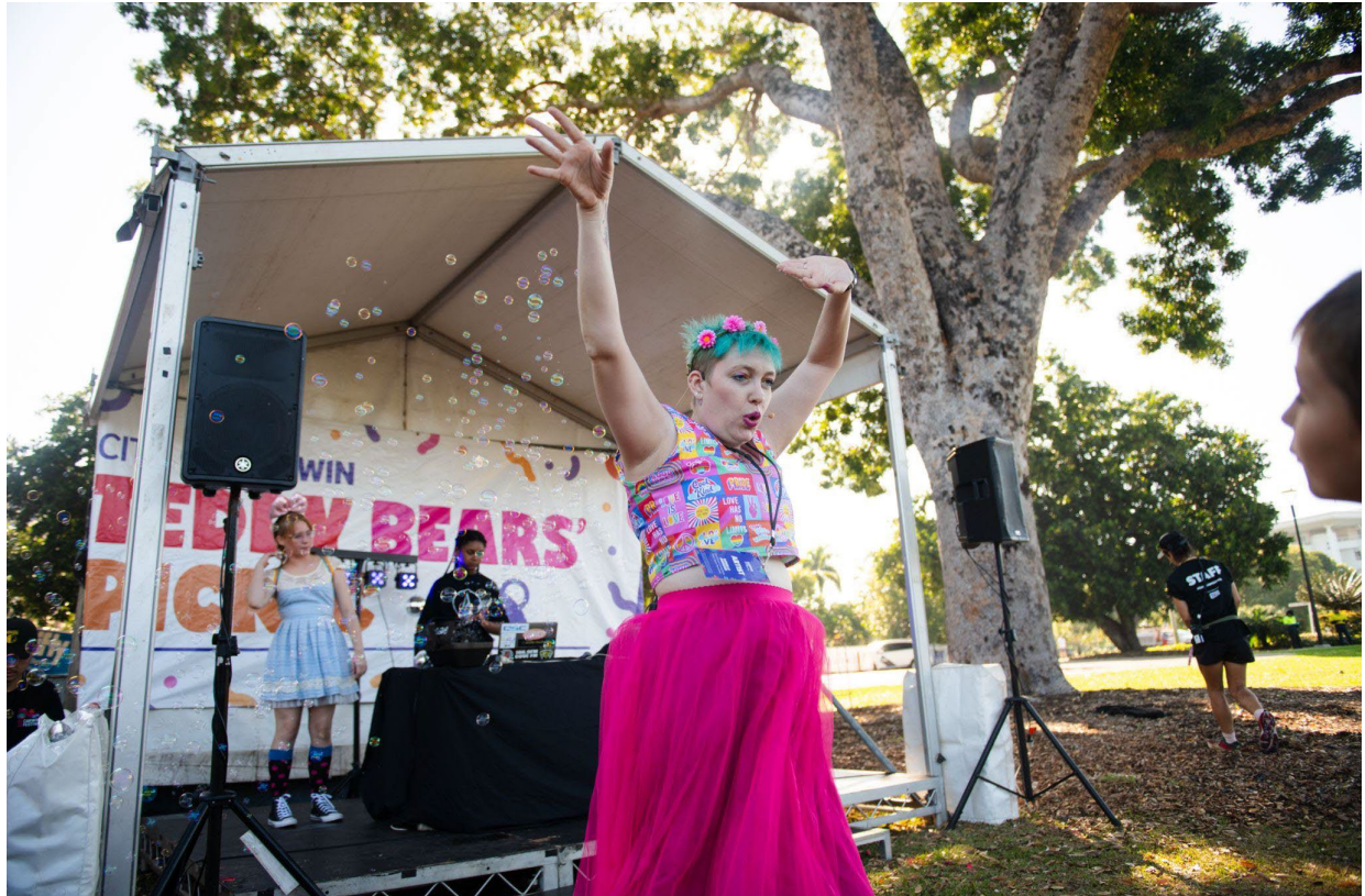
Image Description: At an outdoor event under a large tree, a person in a colorful outfit raises their arms near a stage with a "Teddy Bears' Picnic" banner and a DJ setup.

Some activities may stimulate your senses through touch, bright colours, loud sounds and music.