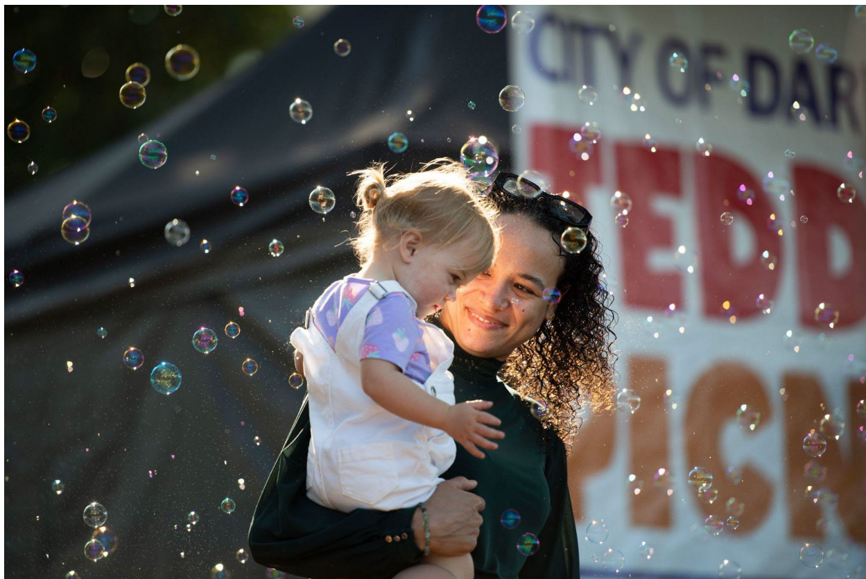
Image Description: A person holds a child amid floating bubbles at a picnic event, with a partially visible "City of Darwin Teddy Picnic" sign in the background.