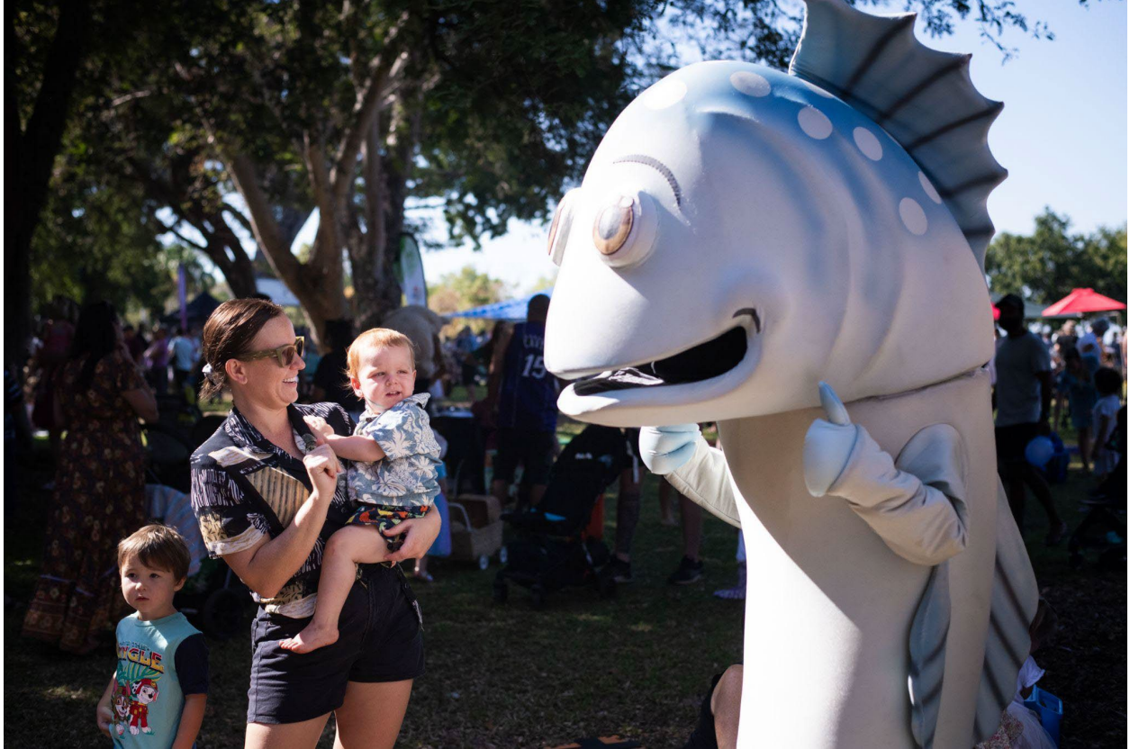
Image Description: A person holds a child next to someone in a large fish costume, with another child nearby in a park setting.

Some people may be dressed up in costumes and pretend to be different characters.