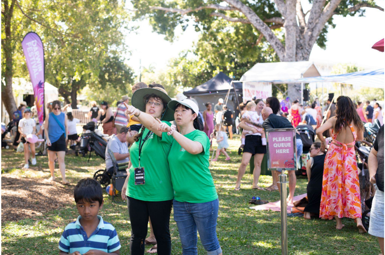
Image Description: At a crowded outdoor event, two people in green shirts point at something off-camera, with a child in the foreground

You may need to line up to join in some activities. There will be signs telling you to do so.