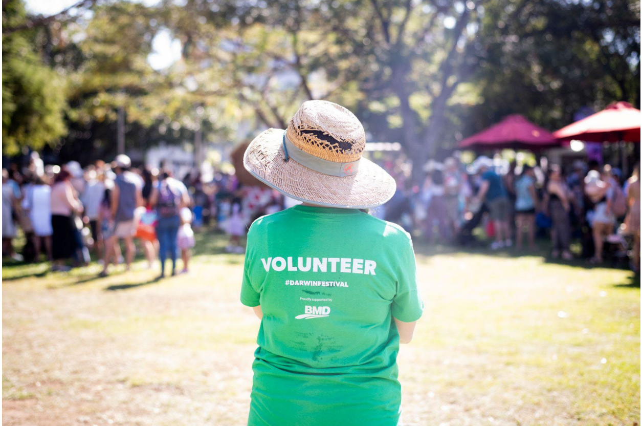
Image Description: A person in a green "VOLUNTEER" shirt and wide-brimmed hat stands in a park during a busy outdoor event.

As always, our friendly volunteers will be there to help with anything you need!