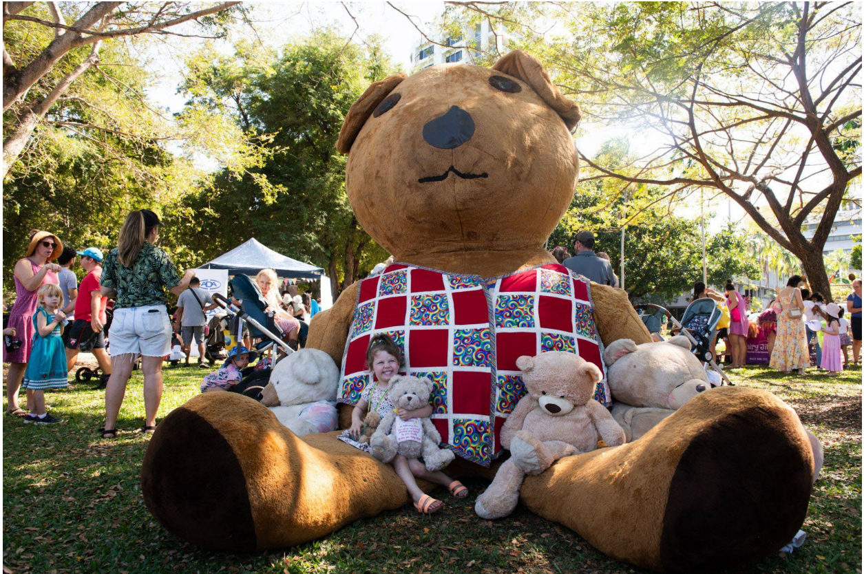
Image Description: A large teddy bear in a red checkered vest sits on grass, surrounded by smaller stuffed animals at an outdoor event.

The City of Darwin Teddy Bears' Picnic is a morning jam-packed with activities for children and families.