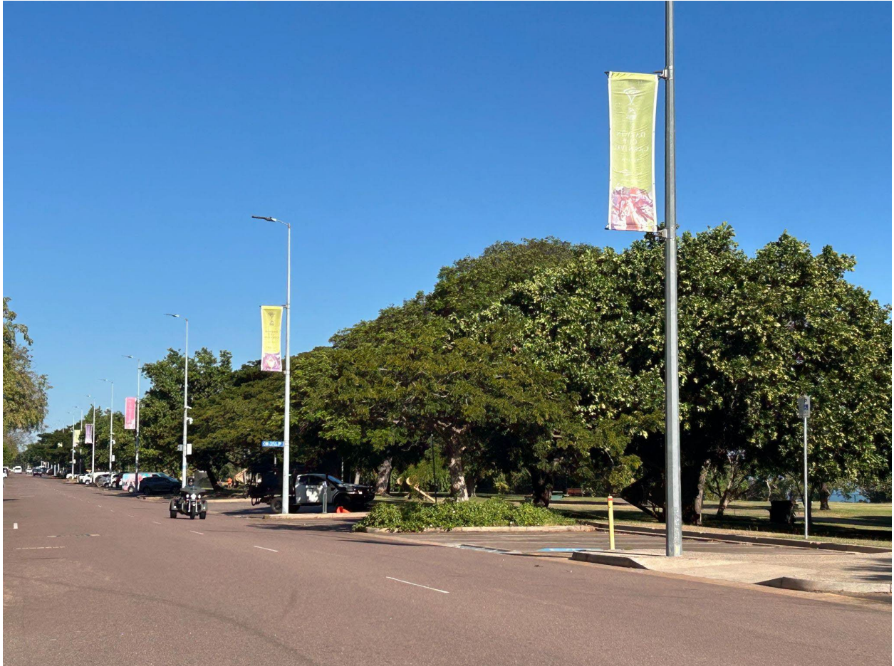
Image Description: A sunny street lined with tall streetlights, green trees, and parked cars, under a clear blue sky.

Street parking is available along the Esplanade, including accessible bays.